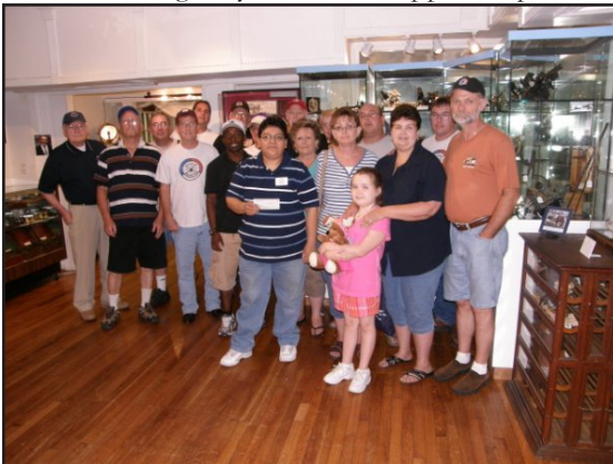
Corvair Houston makes a donation to the Museum