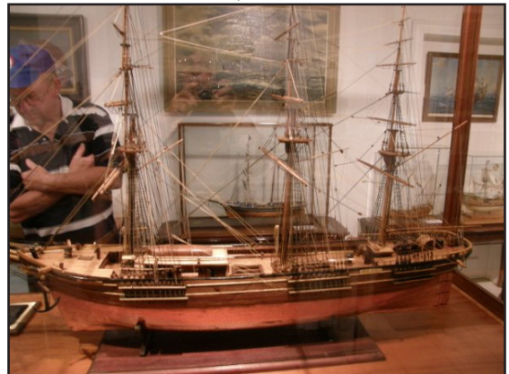
Tour of the Houston Maritime Museum