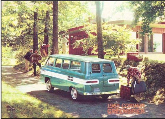
1965 Greenbrier - prototype plan for the Tidwell clan

Corvair Houston 1907 Iron Ridge Sugar Land, TX 77478-4116